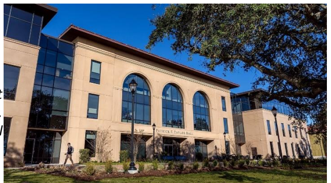
Image: Front of Patrick F. Taylor Hall

A parking pass will be emailed to you prior to arrival. Extra passes can be found at employer check-in. Parking will be reserved in the lot across the street from Patrick F. Taylor Hall. The lot entrance is named "314 Touchdown Village West Lot" and is also known as the x-174 lot.