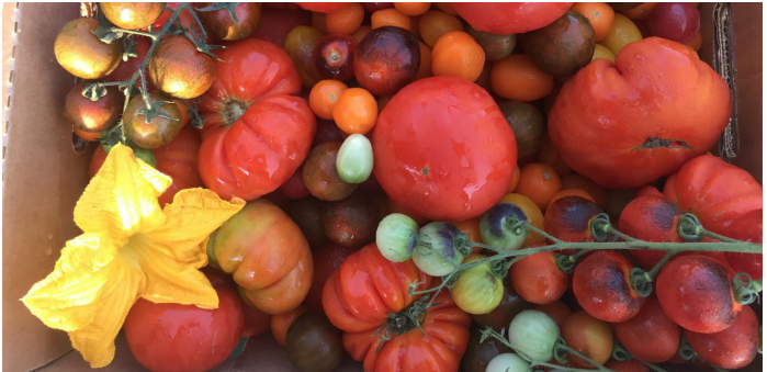
Tomatoes for tasting at Garden Fest.