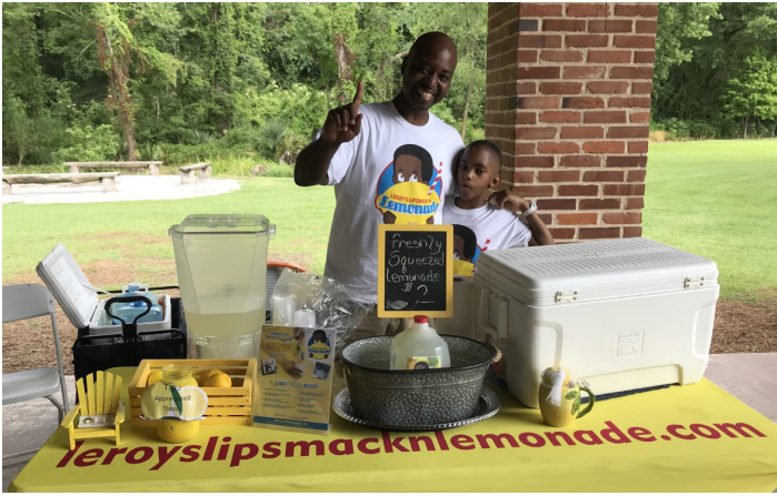
An LSU AgCenter Food Incubator business sets up shop at Garden Fest.