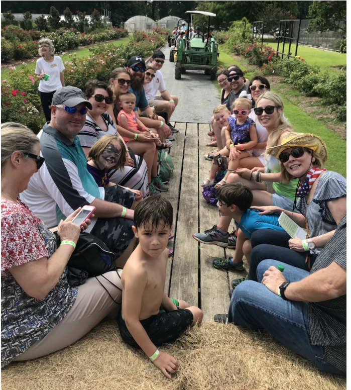
Hayrides bring visitors to the fields during Garden Fest.