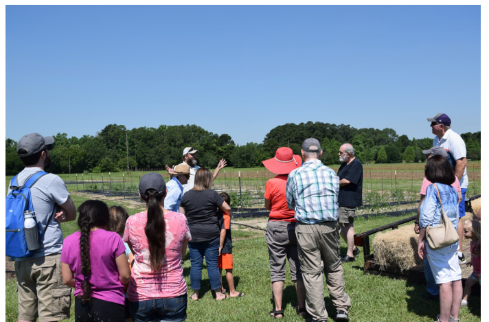
Farm Day at National Public Gardens Week.