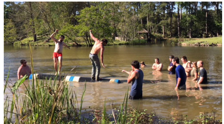
Students compete in log birling event on the ponds at Windrush Gardens.

According to an LSU AgCenter press release, the conclave is part brain and part brawn and includes more than 20 technical and physical forestry competitions that challenge students with identifying wildlife, estimating timber, climbing poles, chopping logs, throwing axes and log birling — running on a log in water while trying not to fall. Stephen F. Austin State University placed first overall, the University of Arkansas at Monticello was second and Clemson University came in third.