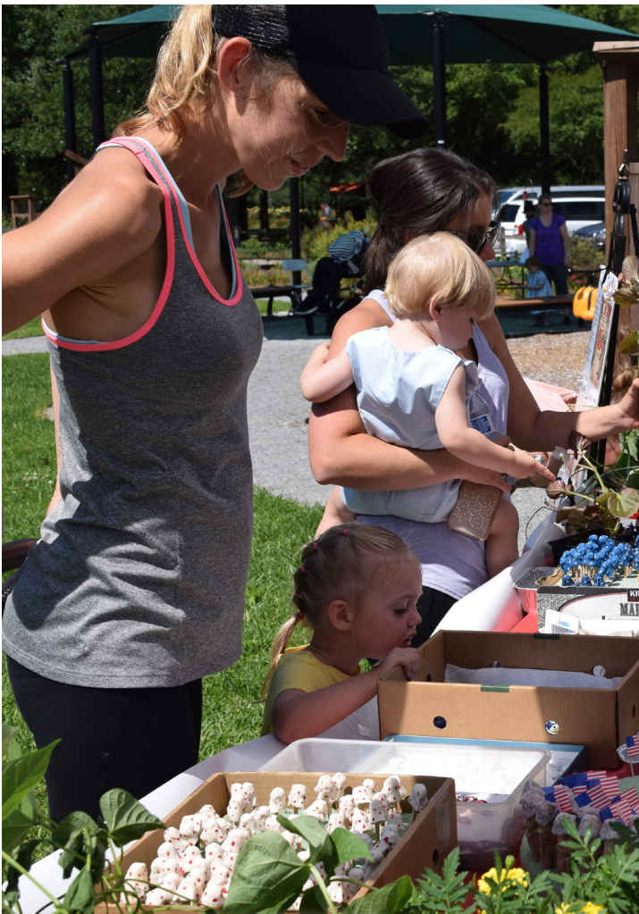
Family Day at National Public Gardens Week.