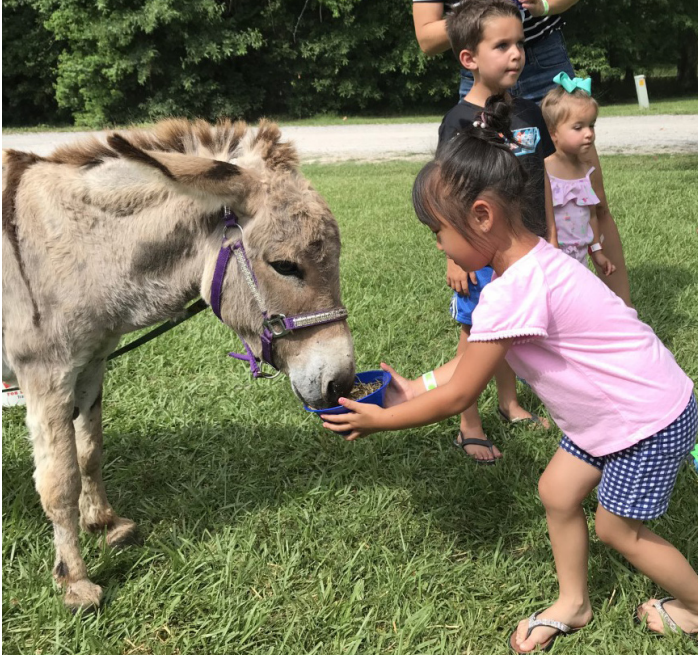
Miniature donkey from Bayou Goula Farm at Garden Fest.