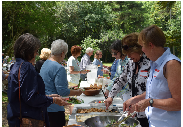
Volunteer Appreciation Luncheon in Windrush Gardens.