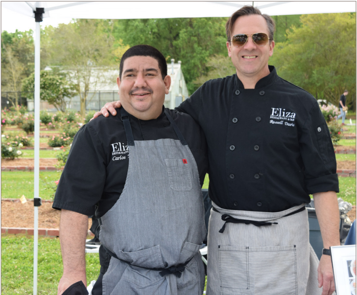
Chefs taking a moment for party pics at Gourmet in the Gardens.