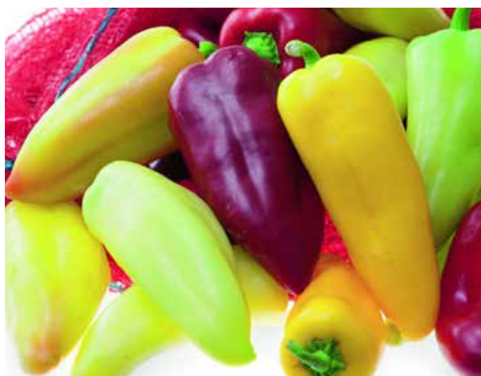
AAS National winner 'Pretty N Sweet'. A multicolored pepper described as an "ornamedible" — attractive and edible at the same time

This Genovese Basil has an attractive compact shape with tender sweet leaves that make an excellent pesto. The plant is quick to recover after harvesting leaves and keeps a desirable ornamental shape that works well for container-grown plantings, borders or as a focal point. This selection is also exceptionally drought tolerant for use in areas where water is not easily accessible. Produced by: PanAmerican Seed