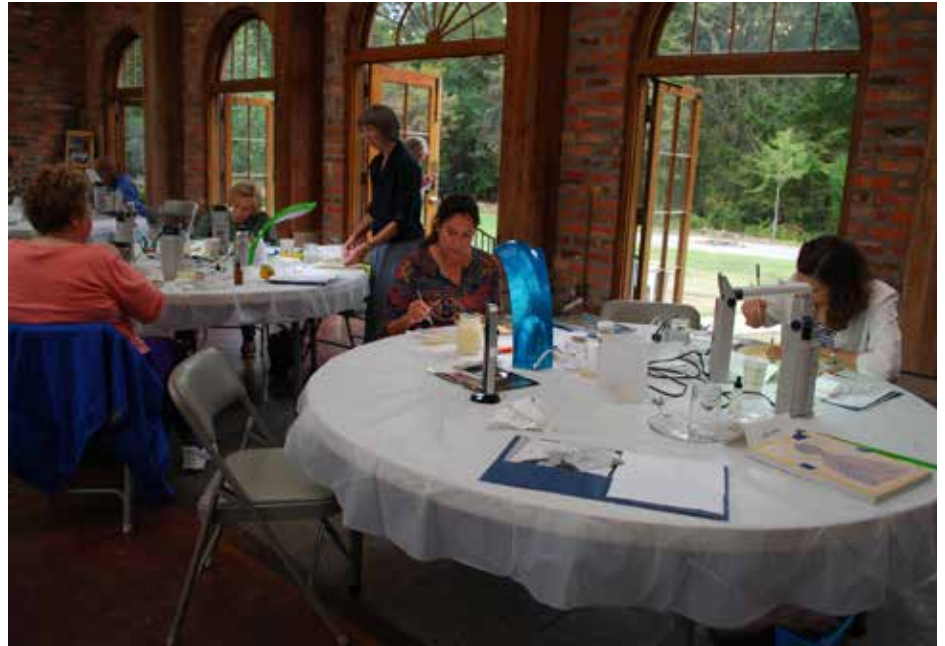
Byzantine iconography workshop held in the Steele Burden Memorial Orangerie at the LSU AgCenter Botanic Gardens at Burden